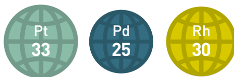
Primary Energy Demand (MJ/g)