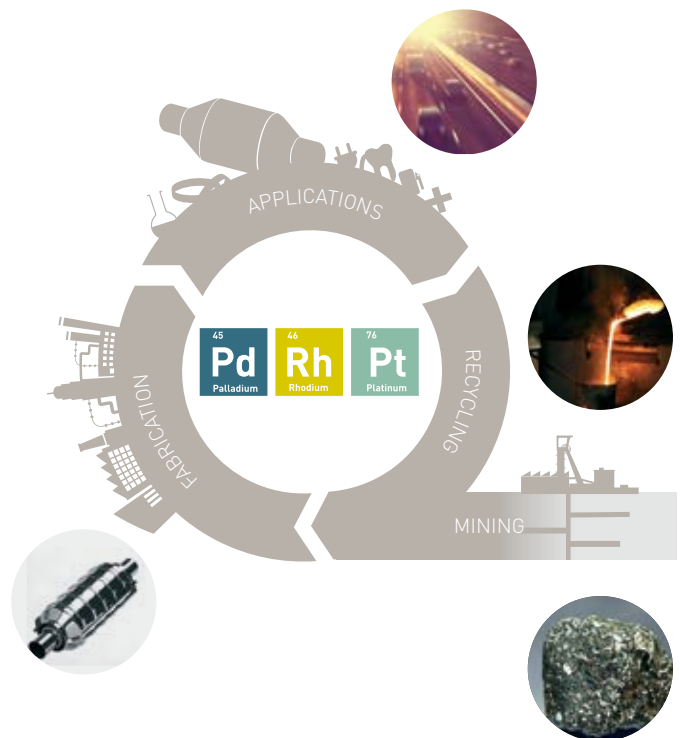
Cradle-to-gate life cycle of PGMs IMAGE CREDIT: Platinum Ore . Johnson Matthey.

Based on input from IPA members, the study focused on quantifying the environmental impact of the average production of PGMs, the fabrication of autocatalysts using PGMs as well as the use of these catalytic converters in a EURO 5 vehicle system over a lifetime of 160,000km. This enabled the evaluation of the benefits of PGMs during the vehicle’s lifetime.