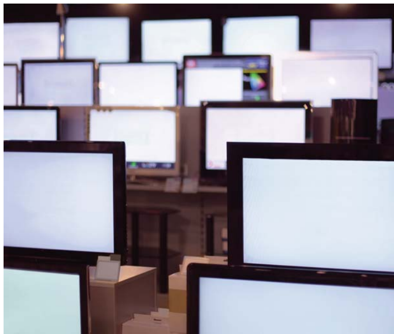
Row of plasma screens; © Pavel Losevsky - Fotolia.com

Unlike base metal alloys, platinum and platinum alloys do not react to glass, nor do they oxidize or scale at high temperatures, thereby maintaining the purity of the glass. Rhodium is alloyed with platinum in various proportions from 5 per cent rhodium up to 30 per cent rhodium. The addition of rhodium increases the strength of platinum alloy equipment and extends its life. ■